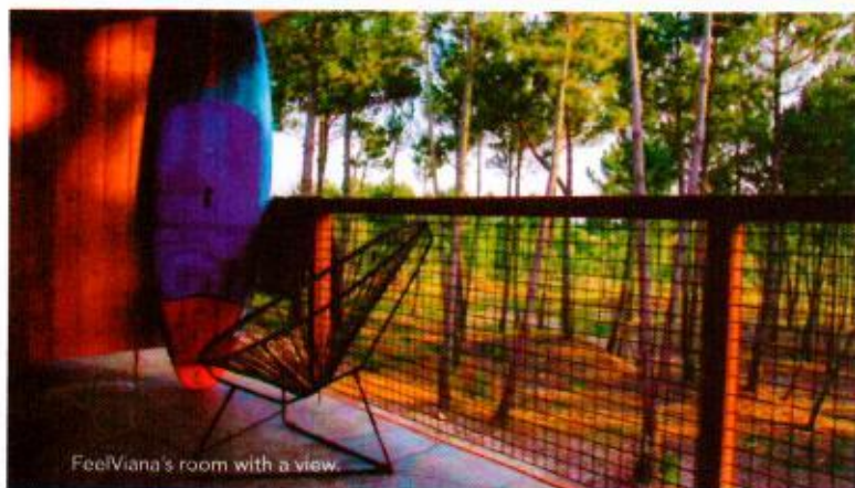
FeelViana's room with a view.

www.hotelfeelviana.com info@hotelfeelviana.com (+351) 258 330 330