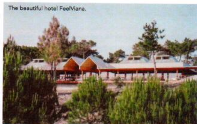
The beautiful hotel FeelViana.

“ The sea air mixes with the essence of the rich greenery that surrounds for a healthy cocktail to inhale. ”