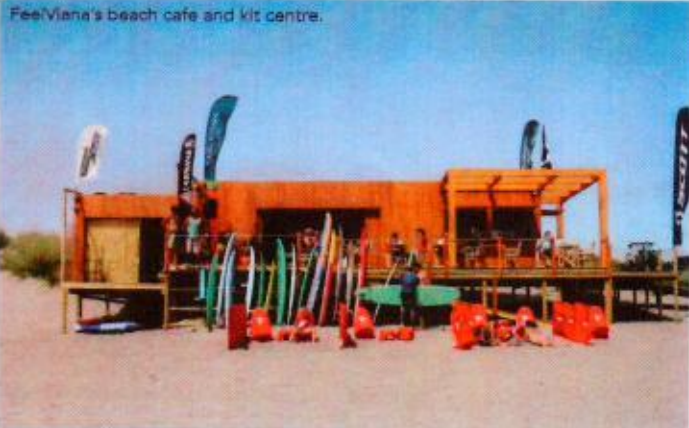
FeelViana's beach cafe and kit centre.