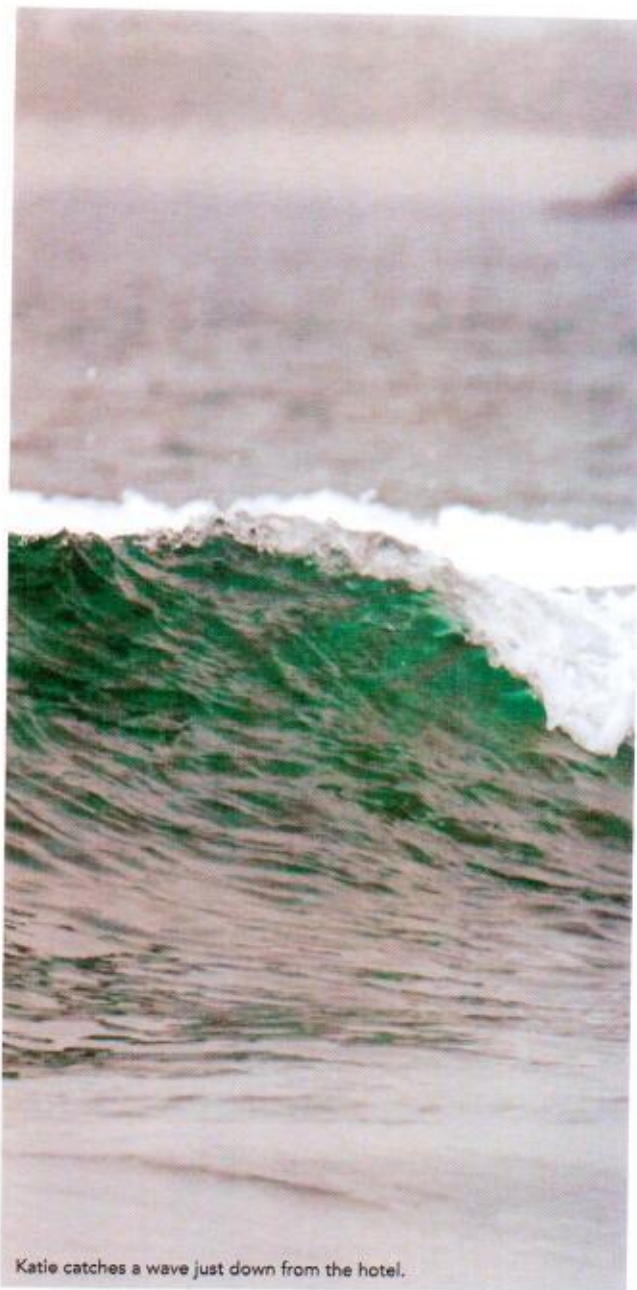
Katie catches a wave just down from the hotel.

Family accommodation is well catered for with larger rooms or bungalows available for 2 adults and 2 children and the hotel and staff is very family friendly and offer an adventure club for 8-12 year olds. Just down the boardwalk from the hotel is a small beach on the inside of the breakwater which offers very sheltered waters for swimming or learning to SUP and is great for kids, with lifeguards also on patrol here. The whole area feels very safe and the amenities of a city such as supermarkets and hospitals are nearby. Portuguese people love children so be prepared for free treats and your dearest to be the centre of attention and affection. They say a measure of society is how you treat your young, old and sick. I can say from my experience of